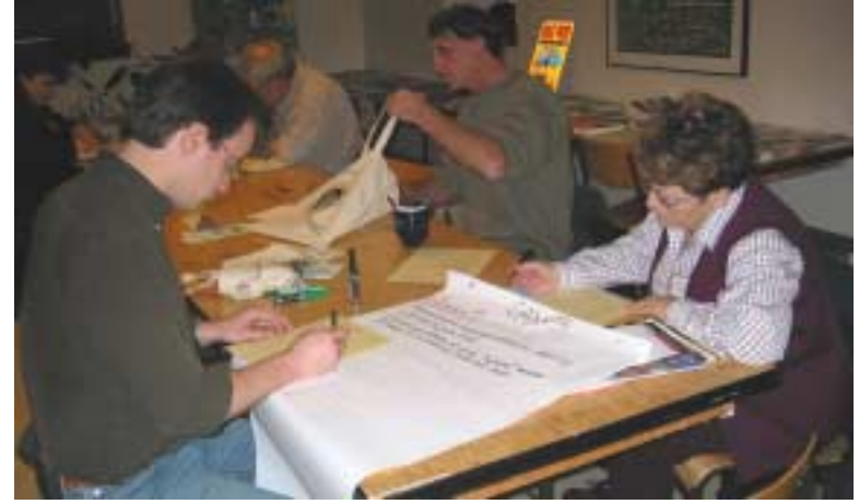
Participants in groups 2 and 3 fill out evaluation forms while they wait to present their community vision.